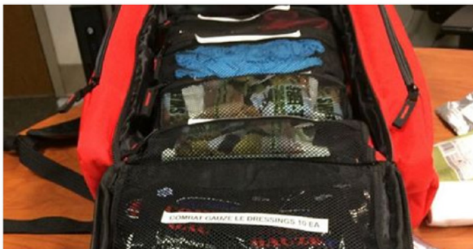
Saving Lives at Active Shooter Events is in the Public's Hands

http://www.abetteremergency.com/.../saving-lives-at-active-s.../