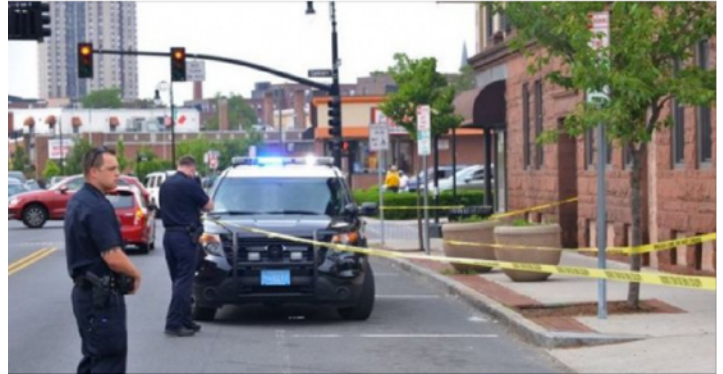
Springfield police investigate Main Street stabbing in South End

"This is a 90 year old female with several ruptured varicose veins in her left foot. She lost a considerable amount of blood prior to arrival. Was pale, disoriented, & diaphoretic. EMRs couldn't get the bleeding stopped with trauma dressings. Upon my arrival the dressings were removed, wounds were packed with folding gauze, trauma dressings, & a SWAT-T applied. Bleeding stopped in seconds, patient also had an IV with fluids hung due to hypotension secondary to hypovolemia." -C